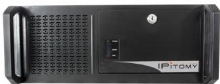
IP5000 - Pure IP PBX

Go to IPitomy.com for more details and a complete list of features.